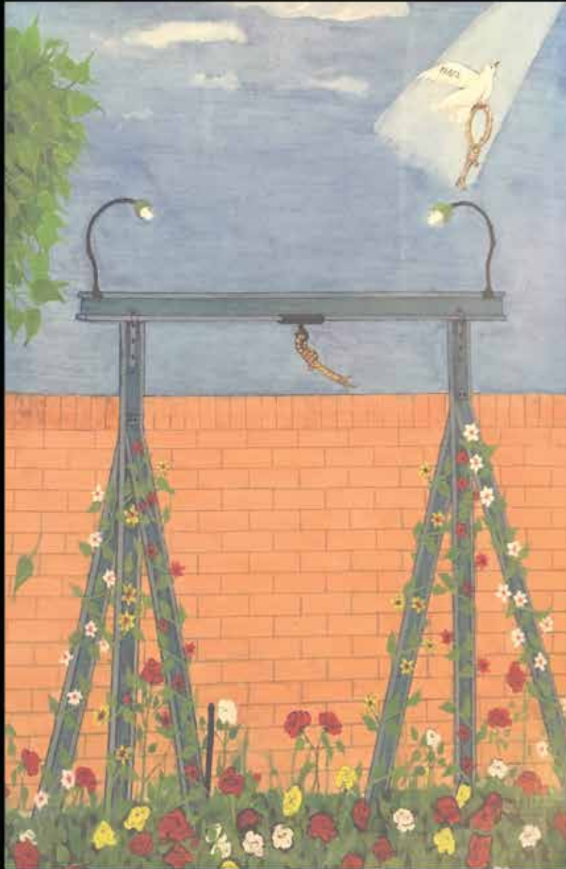
Painting by Aftab Bahadur - Juvenile Offender Executed in 2015